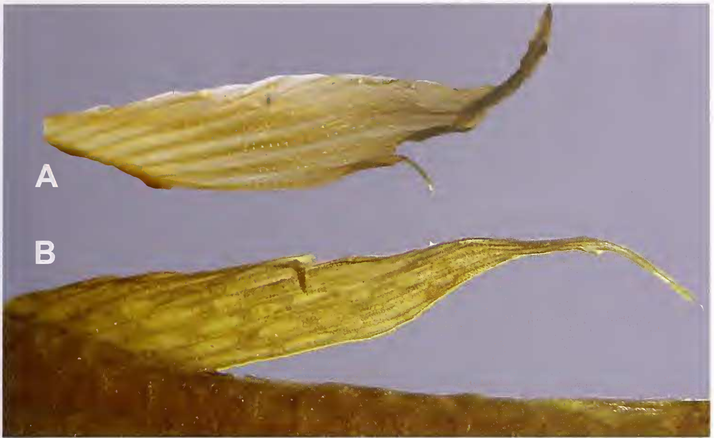
Fig. 3. Dorsal fin of male specimens preserved in ethanol. In these specimens the red pigmentation is lost, but the difference in colour pattern between the two species is still visible. A) A. pseudoelegans , MRAC 80709–80777, Bokuma, with plain greyish to brownish fin tissue. B) A. elegans , MRAC 93724, Bokuma, fin tissue with light dots which are the remains of the former red pigmentation.

Aphyosemion congicum has only a few red dots on the flanks and an almost dotless anal fin versus many red dots or bars on flanks, anal fin with many red dots or inter radial red stripes.